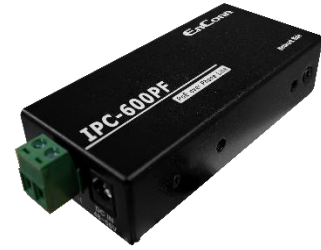
Transmitter (Network Side)