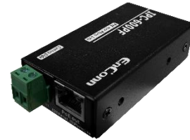
Receiver (Camera Side)